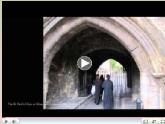
Hear the St. Paul's Choir's 2012 performance of the St. Paul's Cathedral Magnificat

St. Paul's Episcopal Church is located at 661 Old Post Road, Fairfield, Connecticut, on the Town Hall Green, and is handicapped-accessible.